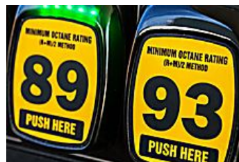
Drivers Are Stunned By This New Rule Improve Insurance