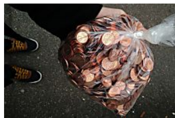
Low Cost Business Ideas Entrepreneur