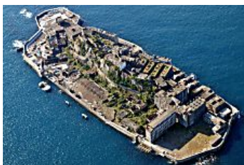
These Abandoned Military Bases Will Leave You Speechless [Slideshow] History Fanatic