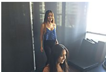
Say Goodbye To Your Privacy Instant Checkmate