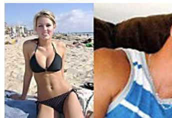
10 Of The Most Shocking And Saddest Catfish Stories Ever LOLWOT LISTS